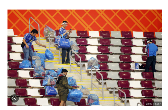
Japanese fans cleaning the stadium

Japanese fans cleaned the stadium after Japan won 2-1 against Germany, after Japan won 2-1 against Spain and after losing against Croatia on penalties in the Fifa World Cup 2022 in Qatar. Japanese fans said "This place is not ours, so we should clean up if we use it. And even if it isn't our garbage, it's still dirty, so we should clean it up!"